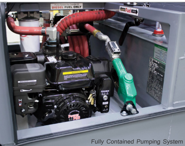
Fully Contained Pumping System