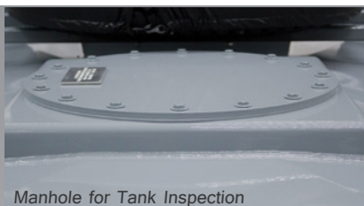
Manhole for Tank Inspection